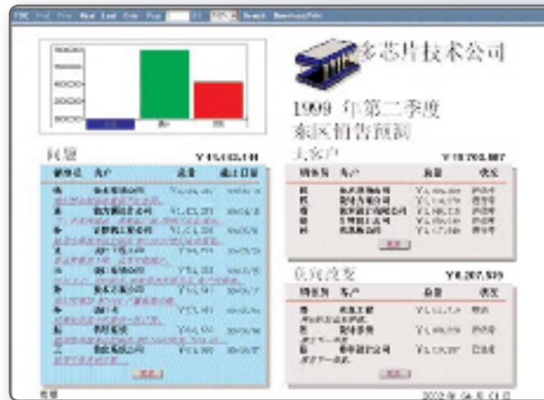
Actuate's support for Unicode enables you to deliver reporting content for multiple locales simultaneously.

Embeddable reportlets —In addition to standard DHTML, HTML, PDF, Excel and XML formats, Actuate iServer can return report content as a Reportlet™, or partial DHTML page, which can be easily integrated into existing web pages. Reportlets enable web application developers to extract only the Actuate content they need and place it exactly where they want it, so that end users can get reporting content as an embedded and seamless part of their web pages.